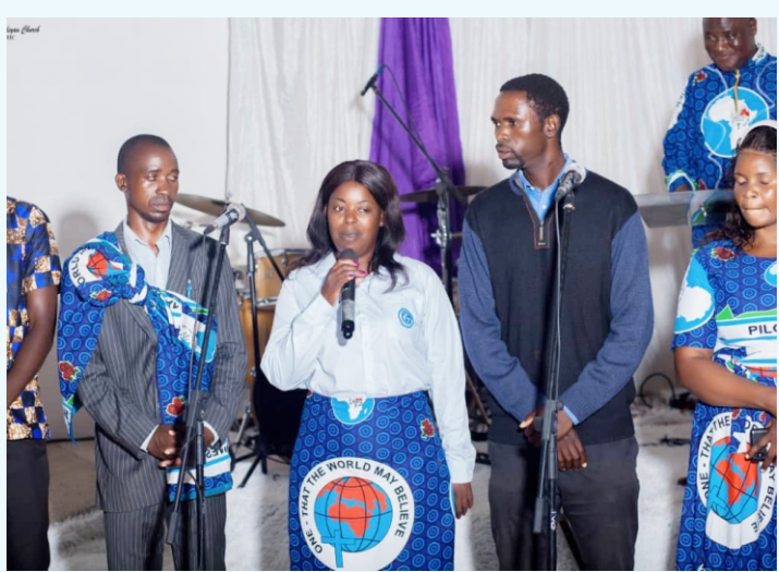
Part of Kanyama leadership team.