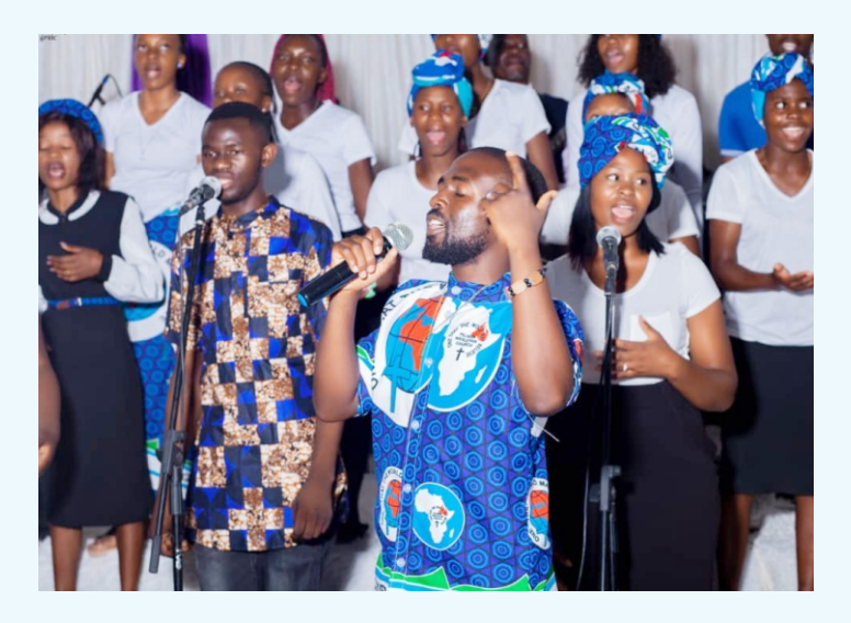
Voice of The Truth. Our Praise Team. Leading the congregation in the song. "See What The Lord has done.