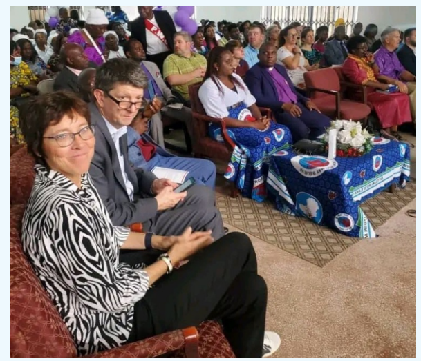
Part of the congregation