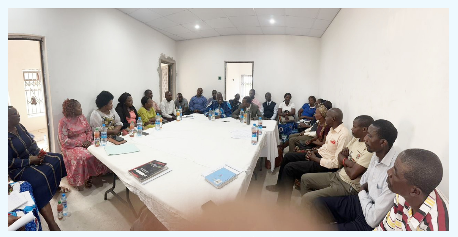
Our meeting with 18 leaders from El-Shaddai.