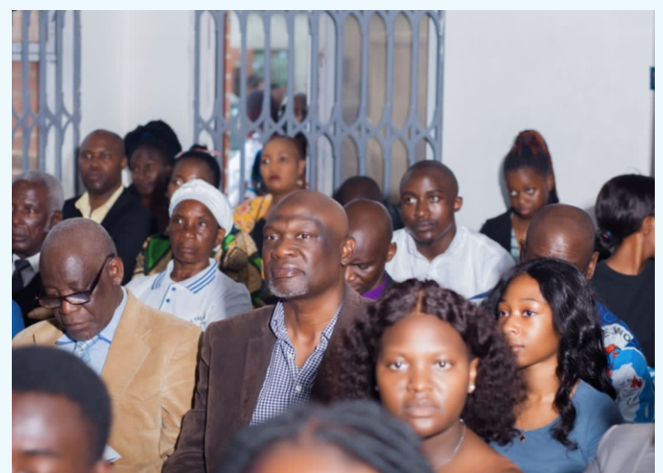
Part of the congregation