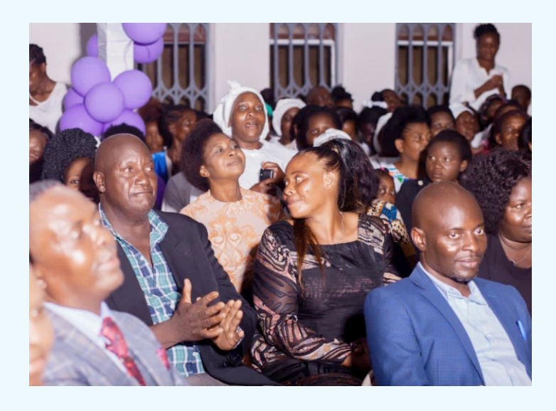
Part of the congregation.