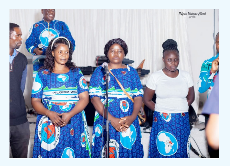
Part of Kanyama church leadership team.