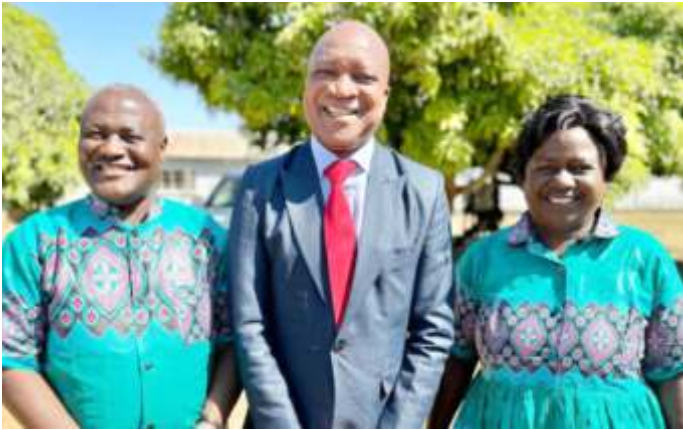
Partnership with the government in Education: With Honourable Douglas Syakalima, Minister of Education.