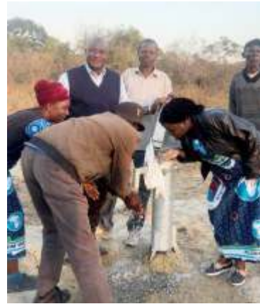
Water is life. Provided a borehole and water pump installed at Senzo Village Church Borehole in Nangoma district.