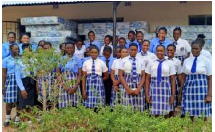
All smiles. We donated 45 mattresses to Chabbobboma Secondary School in Gwembe district to help girls in the boarding.