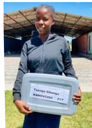
Happy and thankful Taonga for the Christmas box.