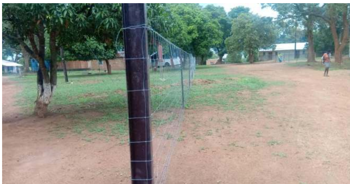
Fencing: Supporter the fencing of Jembo Primary and Secondary Schools, Pemba district