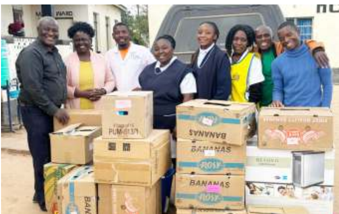
I was sick and you visited me. Visited Siachitema Rural Health Centre and donated medical supplies