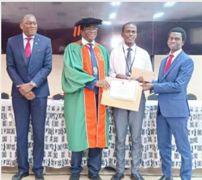
Receiving the Human anatomy award from the head of department of the anatomy department (right), The Dean of the school medicine(middle) and a representative of the ministry of health (left)