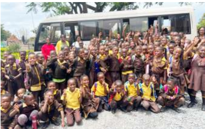
Children our future: Educating our future at God Is Able School in Ndola.