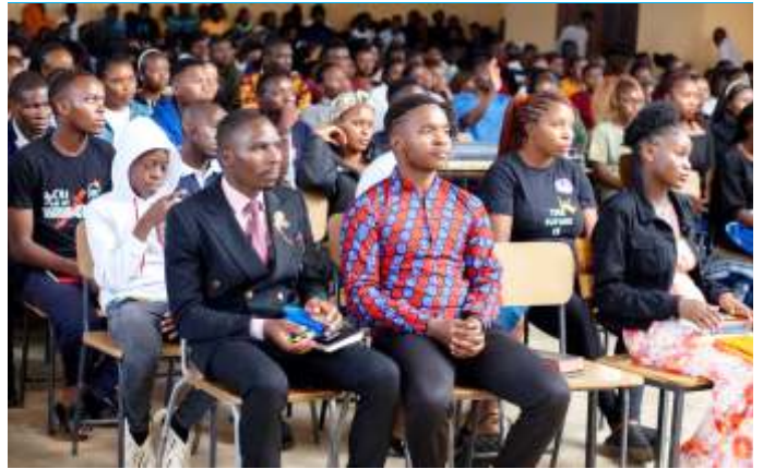
Investing in our Youths: Supported the Pilgrim Wesleyan Church Camp which was held in Chongwe in December, 2023. Over 1,000 youths attended.