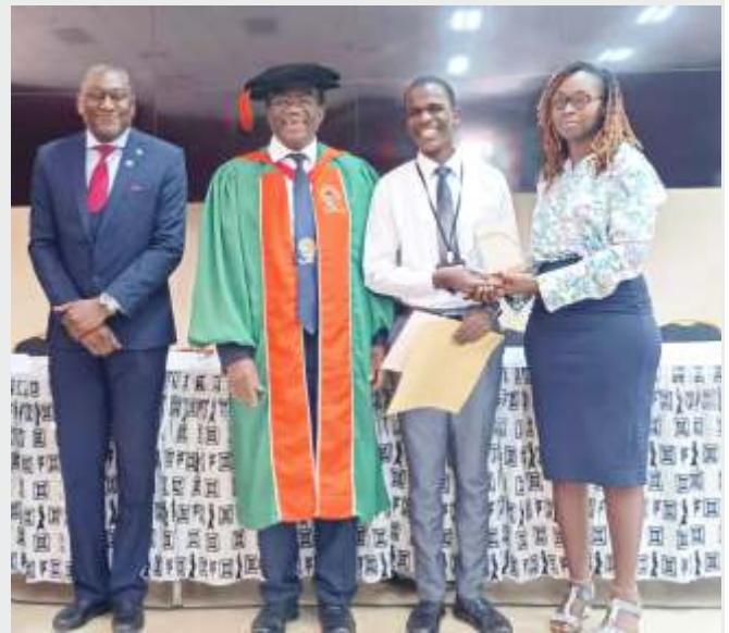
Receiving the Human physiology award from the head of department of the physiology department (right), The Dean of the school medicine(middle) and a representative of the ministry of health (left)