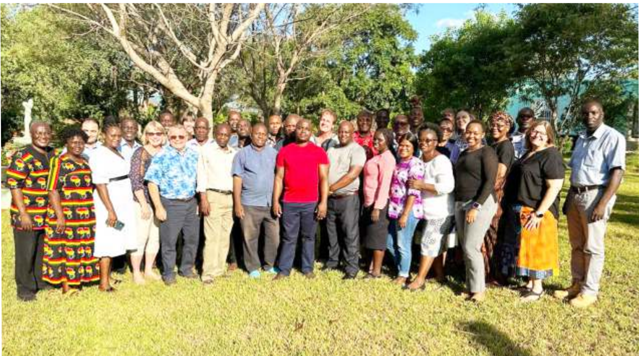
Equipping Leaders: Zambia 2023 Leadership Matters Course in Partnership with International Training Alliance