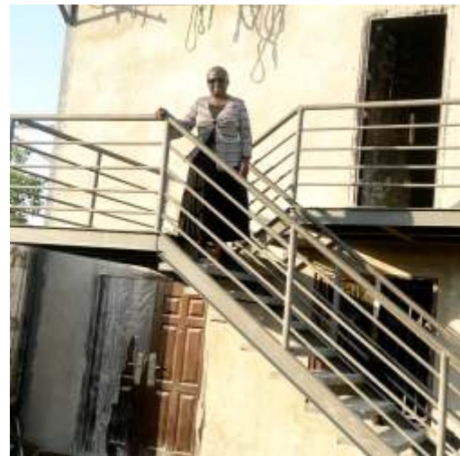
Building the Lord's House Together: PLGRIM WESLEYAN CHURCH-Kanyama NextGEN Worship Centre.