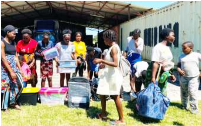
2023 OVC Christmas boxes distribution.